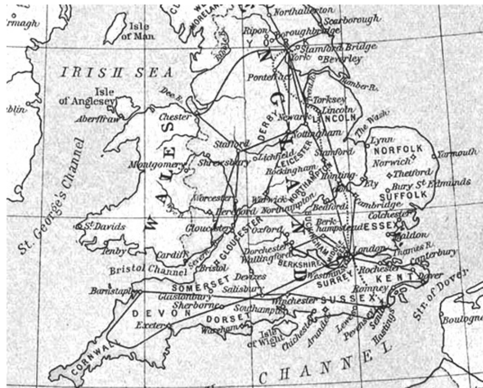
Figure 2: A part of a historical map of the Dominions of William the Conqueror about 1087. The map is "older" than the one necessary for a proper comparison, but very interesting because it is showing main roads too. Historical Atlas by William Shepherd (1923-26).