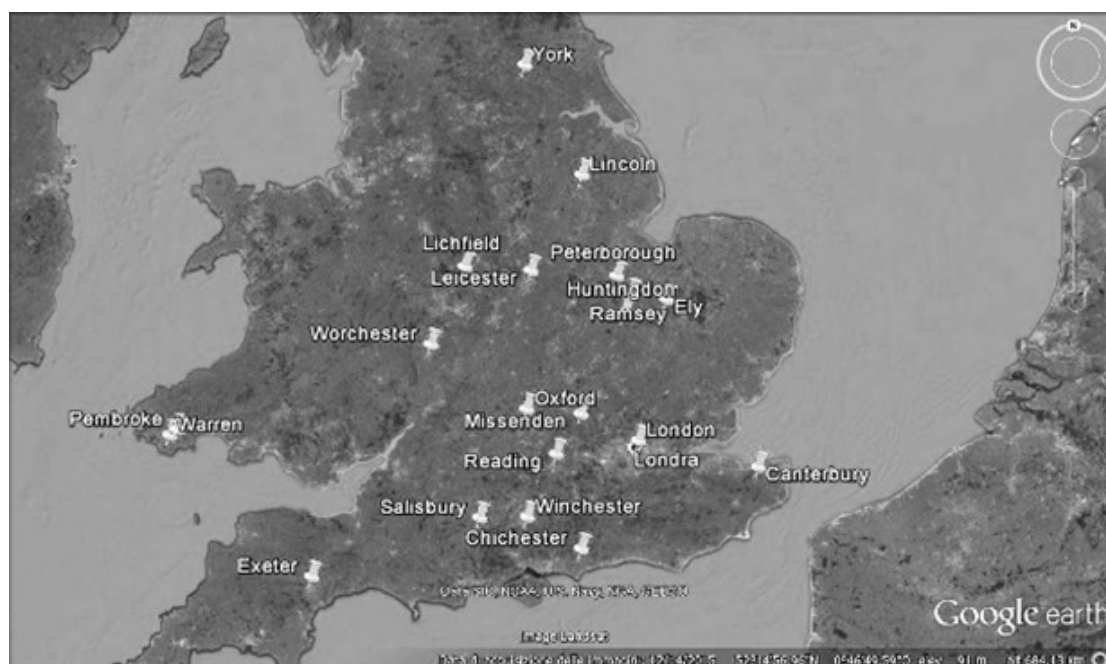
Figure 1: Using the addresses of Grosseteste's Letters that we find in [19], and marking them on Google Earth, we have the map given in the Figure. Note that Grosseteste's political network was covering England almost completely.

[21] Cunningham, J.J. Editor (2012). Robert Grosseteste: His Thought and Its Impact, PIMS. ISBN-10: 088844821X, ISBN-13: 978-0888448217