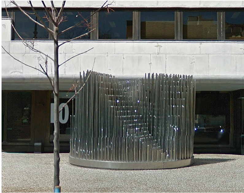
Figure 1: Eusebio Sempere's "Organo".

The experimental work in [10] is very interesting, as explained in [9]. This screen is able of reducing the white noise like the solid panelling along motorways can do. But, in the case of the sonic crystals, "over half of the space" in it is empty, and, remarkably, "at certain angles you can see straight through it" [9]. The researchers had also removed some rods to create a sub-lattice of additional gaps. This different sonic crystal has a further blocking band for low sound frequencies of around 500 Hertz.