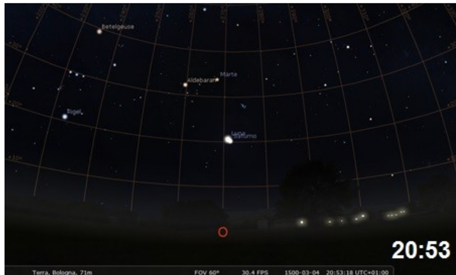
Figure 2: Observation due West (O, Ovest), from Bologna, March 4, 1500. Using Stellarium, we can the motion of Saturn with respect to the moon. Here in the image, the two bodies are almost coincident.

The two examples shown in the Figures 1 and 2 demonstrate the use of Stellarium for the simulation of astronomical events of which we have location and date, of Julian or Gregorian calendar (in the case the moon is involved, the software CalSKY is useful too). In fact, the simulation can help us in understanding the text written by Copernicus, such as in all the other cases of which we have a detailed description in historical records.