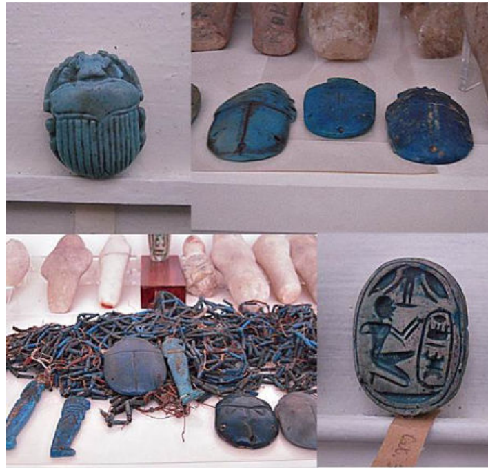
Figure 5: Egyptian scarabs were amulets, often made of faience, having the shape of a scarab. They were also used as seals. Scarab amulets, which represent the sun god, are the symbol of the renewal of the day and of rebirth. And therefore they were included among the grave goods. Here we see scarabs, some funerary figurines and a beaded net of a mummy from the tomb of Khaemuaset and Setherkhepshef, New Kingdom, Dynasty XVIII-XX, Egyptian Museum of Turin. Attached to the net we have a winged scarab and figures of the Sons of Horus.