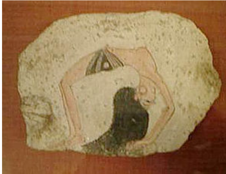
Figure 1: A shred can be a small piece of art, as we can see in this ostracon of the Egyptian Museum of Turin.

The earliest ceramics made by humans were pottery objects, which were made from clay and hardened in fire. After, ceramics evolved in their composition and became glazed to have a coloured, brilliant and smooth surface. The Egyptian faience is one of these ceramics, based on sintered-quartz materials, which has a glossy surface with lustre of various blue-green colours.