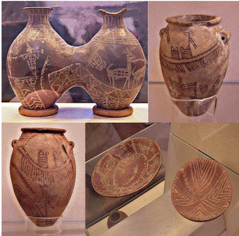
Figure 2: Pre-dynastic pottery of the Egyptian Museum of Turin. During the Naqada II period, we have also the ship theme that we can see in the decoration of the two jars.

the ship theme that we can see in two images of Figure 2. Besides pottery, in the pre-dynastic graves, archaeologists found the first simple objects made of faience, some blue glazed beads that were used as substitute for precious materials such as turquoises [2]. After, faience was used for more complex artifacts.