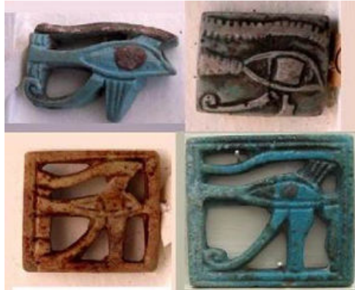
Figure 3: Amulets representing the Eye of Horus, Egyptian Museum of Turin. This Eye is an ancient symbol of protection and good health. It is also known as the Eye of Ra.

Sometimes faience is considered as one of the earliest forms of glass making, and archaeologists suppose that faience, frit and glass were all made in the same workshop complexes. This was deduced from the marked similarity of the composition of faience and contemporary glasses. However, the technology of producing glass and faience is quite different. Let us briefly discuss the working of this ceramic, which is defined as the first human "high-tech" product [14]. Faience is, like our contemporary ceramic materials, an artificial medium; it is a non-clay based mixture, composed of quartz, small amounts of calcite, lime and alkalis. The faience wet mixture is, like the clay, thixotropic, but faience is a difficult material when it has to hold a shape. If pressed too much, it cracks, because of its limited plastic deformation. Therefore, to help its wet working performance, some archaeologists proposed that some binding agents, such as clay, egg white, Arabic gum or resin had been used. However, modern experiments to reproduce the faience suggest just the use of alkalis as binders, such as natron or plant ashes [11].