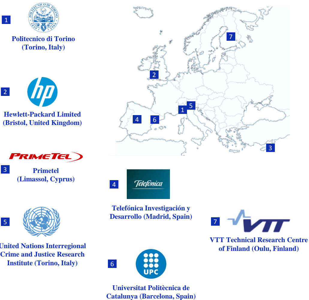
Figure 2: Second page of the project leaflet.

The consortium includes 7 partners from 5 different countries, with a good mix of leading research universities, major ICT companies, and user representatives.